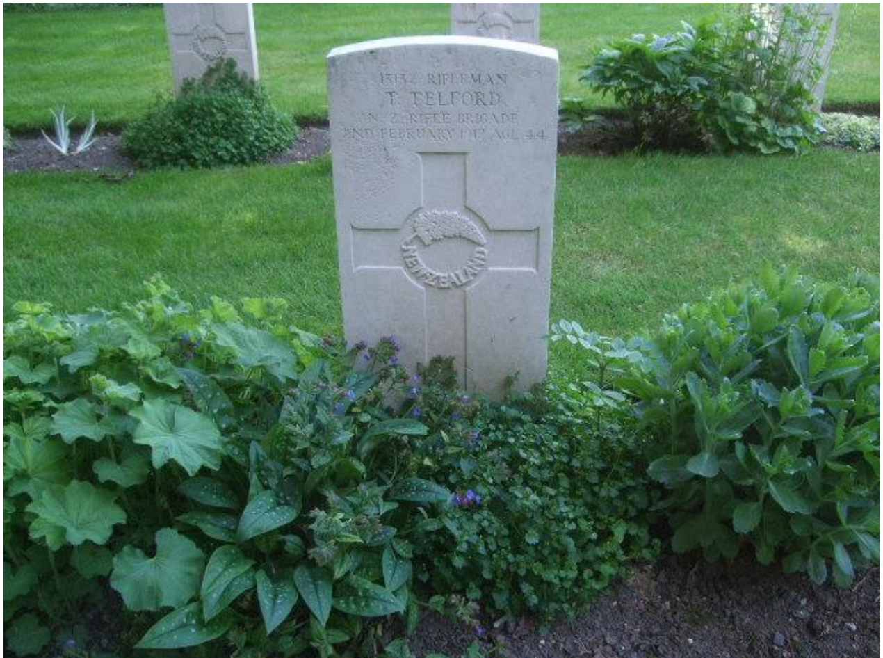
Commonwealth War Graves Headstone for Rifleman T. Telford is located in Second Row (Left Hand Side) Grave Plot # 40 of Codford War Graves Cemetery (CWGC Reference - Grave # 32)