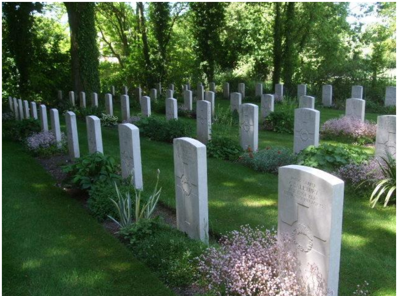
New Zealand Section of Codford Anzac War Graves Cemetery